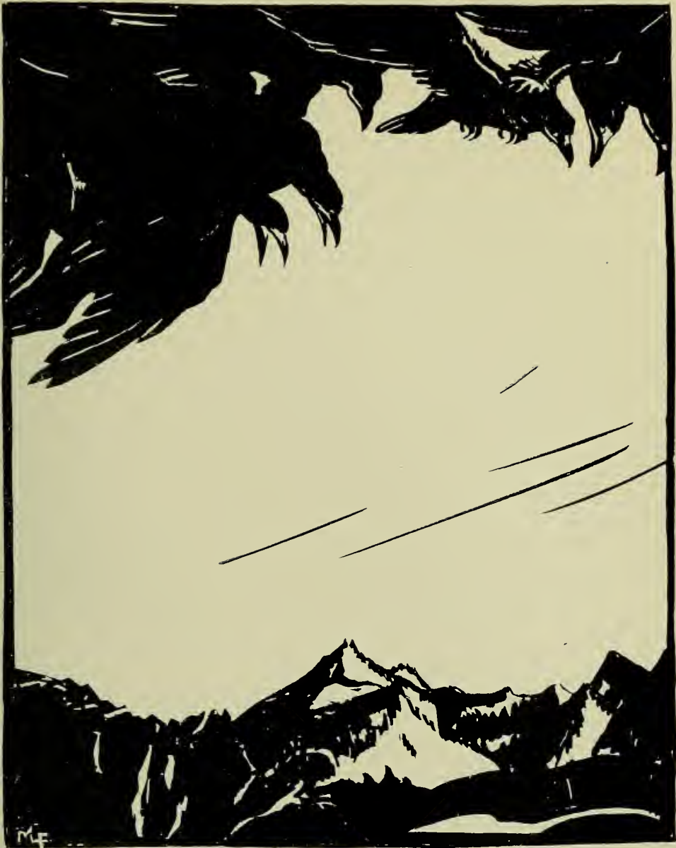
SUDDENLY A LARGE FLOCK OF BIRDS, LOOKING LIKE GREAT BLACK CLOUDS, CAME FLYING FROM THE BLUE HILLS